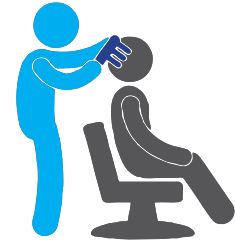
■ 3 Treatment