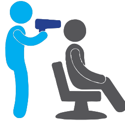
■ 2 Drying