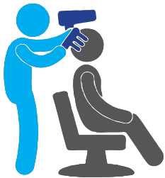
■ 4 Post-treatment drying