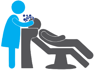
■ 1 Shampoo