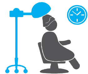
■ 6 Rinse and conditioning or Color Deluxe